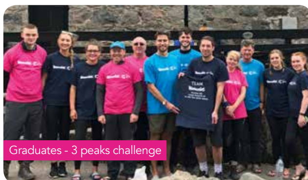
Graduates - 3 peaks challenge