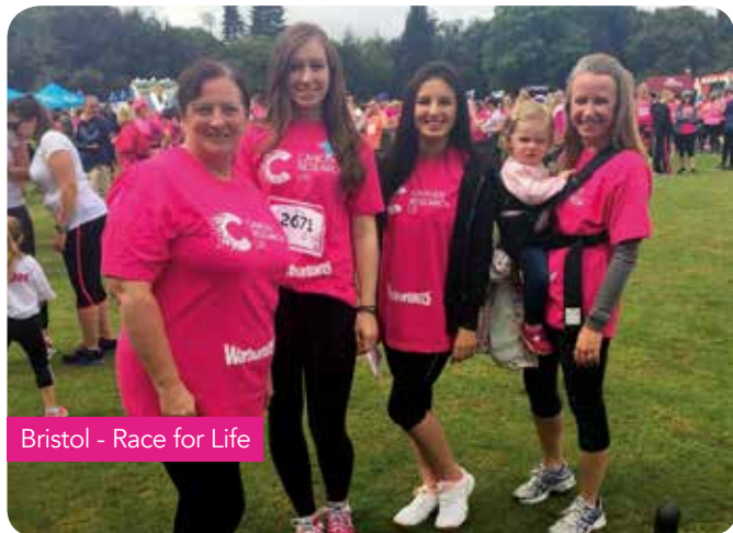
Bristol - Race for Life

Bristol, Port Talbot and Newton Abbot held an England versus Wales football match. England emerged the winners and over £715 was raised for CRUK.