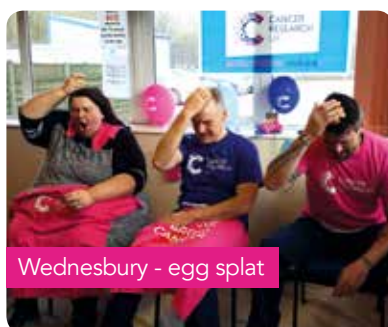
Wednesbury - egg splat

Our support won't stop there. We are on course to hit £1 million raised in early 2018 and our target for the year ahead is £1.5 million. We have no doubt our fantastic team will smash our target again!